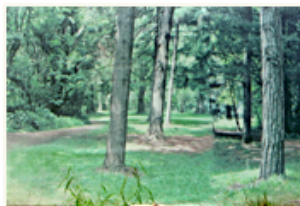
Ester Partegàs You Are Here 2010 Foxy Production

"More World," for its part, serves up a disparate mix of artworks in this same inscrutable vein. A series of life-size, painted polyurethane sculptures of potted plants come off like diseased, mournful spins on Roxy Paire, their leaves rendered different toxic colors, their tops hooded with garbage bags as if they are about to be chopped down. One wall features a large photo of a forest which, upon closer inspection, actually displays a series of visual glitches, indicating that it is a picture not of an actual forest, but of some kind of tree-themed backdrop (in fact it is a vinyl barrier placed around a construction site, meant to give one of the more unsightly aspects of urban space a green veneer). Nearby, two large photo collage compositions center on the image of dozens of greasy french fries laid next to one another, highlighting their regular but varying shapes, a found form of "eccentric abstraction" fished from the bottom of the deep fryer.