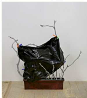
Ester Partegàs Overcast 2010 Foxy Production