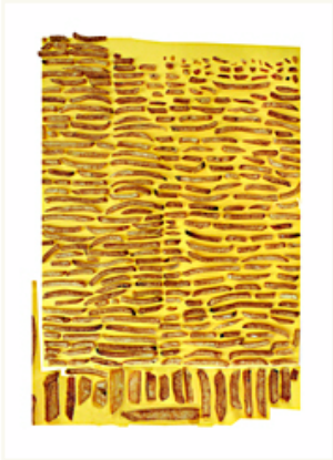
Ester Partegàs Organized Fries 2010 Foxy Production