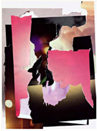
Ester Partegàs Less world (torn advertising magazine pages) 2010 Christopher Grimes Gallery