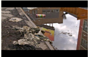
Ester Partegàs Ghost [still] 2010 Foxy Production