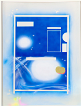
Ester Partegàs Studies in Mysticism (Blue Stellar) 2010 Foxy Production