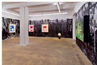
Installation view of Ester Partegàs' "More World" at Foxy Production