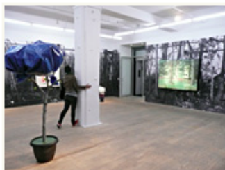
Installation view of Ester Partegàs' "More World" at Foxy Production